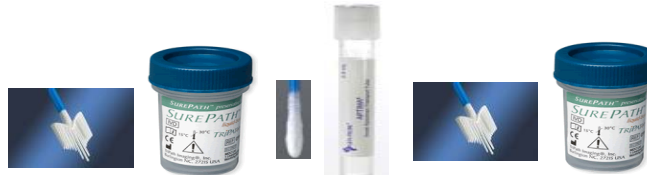
Figure 1. Physician instructions for specimen collection

Sensitivity and Specificity calculations: A patient was considered positive if the CS was positive or the L-Pap sample was positive by AC2 and PT. Confidence intervals were calculated using analysis software (version 2.1.2, 2004; T. Bryant, University of Southampton, UK).